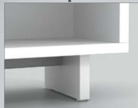
Alternate solid color base option