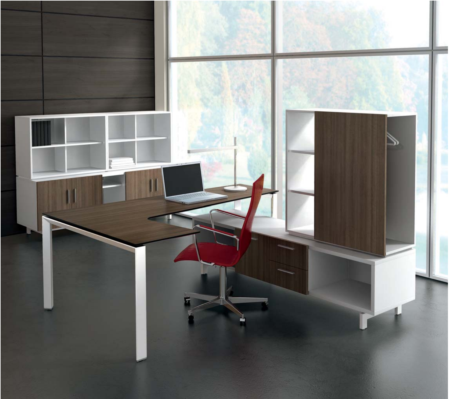
12' x 12' Private Office: MIRO Extended Secondary, ZO Low and High Credenzas, ZO Side Wardrobe and Open Stackers