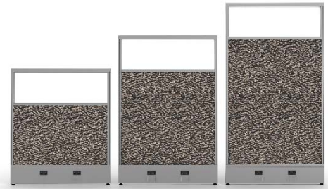
SEGMENTED: FABRIC WITH GLASS*