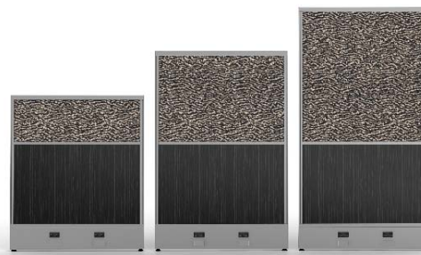
SEGMENTED: LAMINATE WITH FABRIC