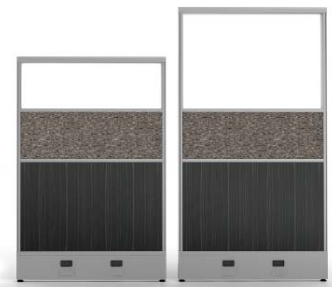
SEGMENTED: LAMINATE WITH FABRIC & GLASS